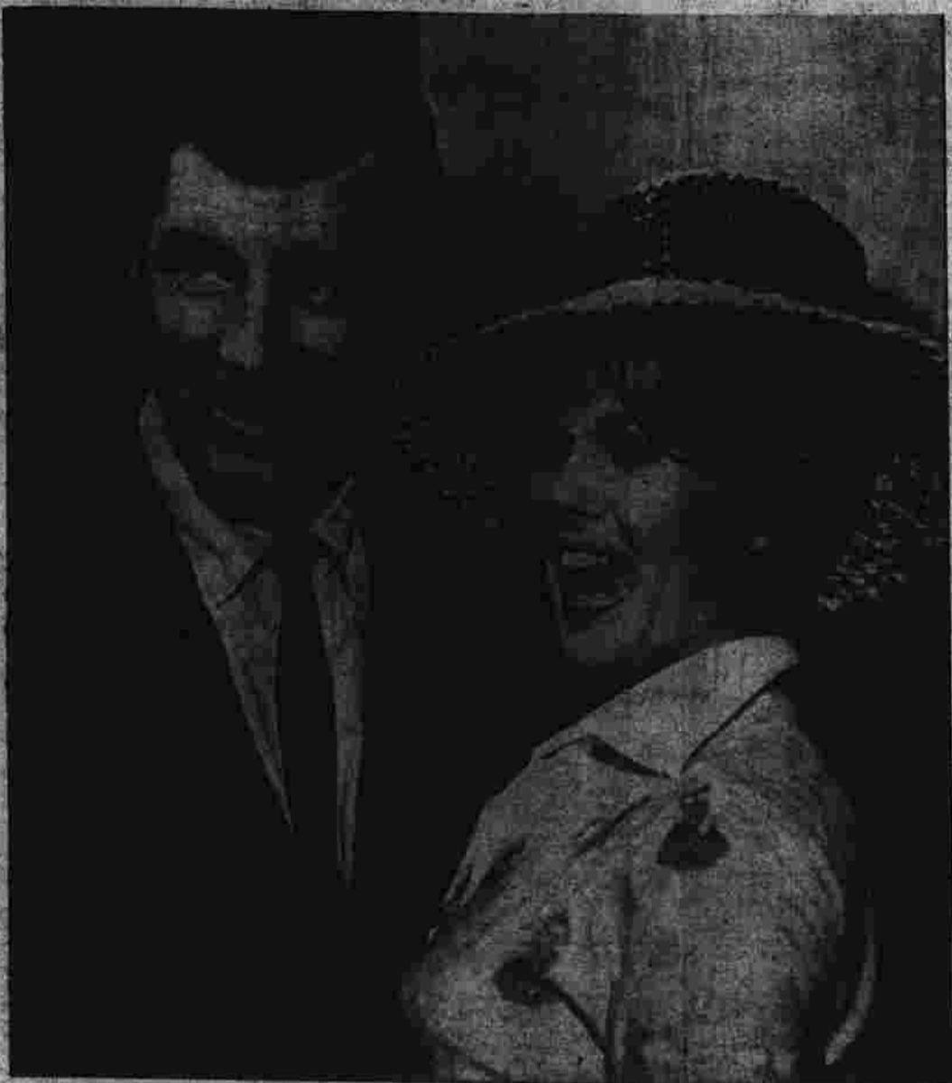
Anthony Eisley and Connie Stevens are the personable stars of "Hawaiian Eye," seen over the ABC-TV network Wednesday nights. Eisley gets an assist from Connie in solving a jewel burglary in the next episode, "An Echo of Honor."

VIDEO EVERY WEEK—ALL RIGHTS RESERVED. H. T. DICKINSON & CO., Inc.