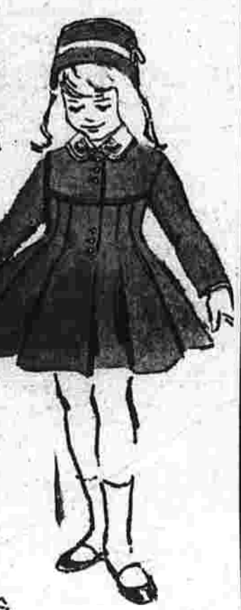
above: all wool prin- cess coat embroidered in full over, navy, apri- cot, banana, rose, aqua, red, navy, 3 to 6x, 7 to 14, 21.99 with matching hat!