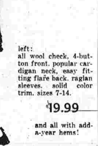
left: all wool check, 4-but- ton front, popular car- digan neck, easy fit- ting flare back, raglan sleeves, solid color trim, sizes 7-14, 19.99 and all with add- a-year hems!