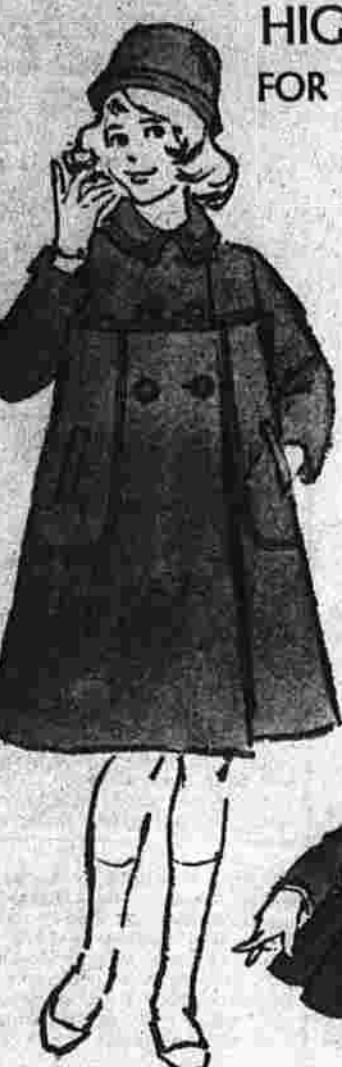
left: bambury suedella, featuring a high yoke and flaring skirt, navy, roses, peach, gold, kelly, nude, red, 3 to 6x, 7 to 14, 24.99